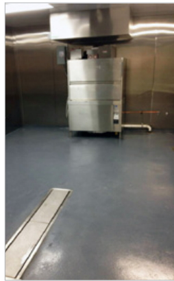
CSI Division 9: Finishes - Flooring